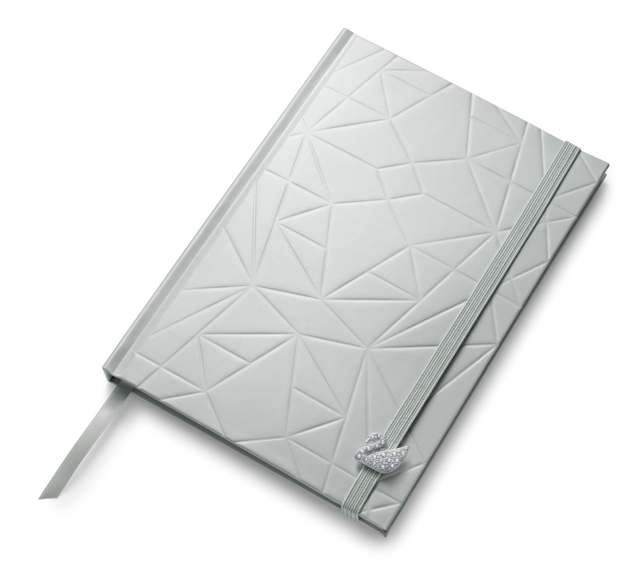
NOTEBOOK WITH SWAN CHARM

5247169-1 Color: crystal / gray / 128gsm art paper / 140gsm wood free paper 14.6\times1.2\times21~cm\ /\ 5^{-3/_4\times7/_{16}}\times8^{-5/_{16}}~in